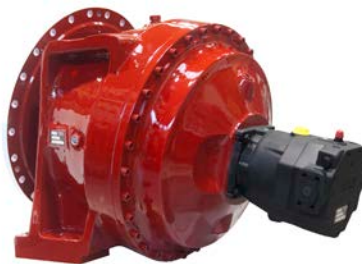
PMB + PMH MCF / M GEARBOX WITH HYDRAULIC MOTOR