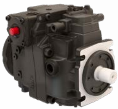
PMH P AXIAL PISTON HYDRAULIC PUMP