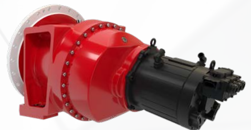
PMB 7.5E GEARBOX WITH ELECTRIC MOTOR

PMP designs and manufactures efficient, solid, reliable and quiet mixer truck gearboxes coupled with efficient and durable hydraulics to provide mixer trucks manufacturers superior quality and performance experience.